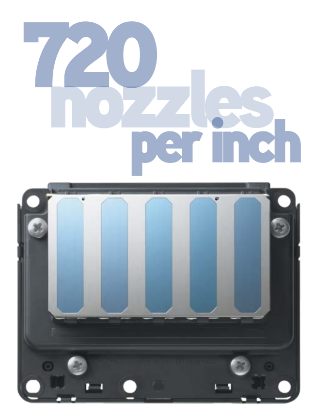
Epson PrecisionCore TFP Actual print head used in the SureColor F-Series printers