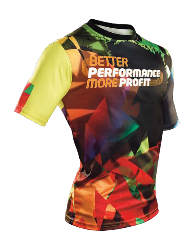
Typical Dye-Sublimation Applications 100% Performance Polyester