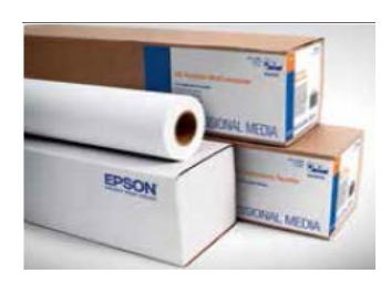
Epson DS Transfer Media